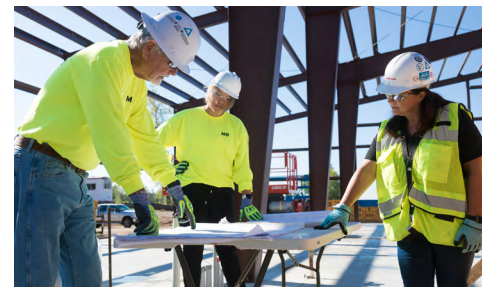
> MB Customs founder and new owner talk over new maintenance facility plans with Enbridge representative.