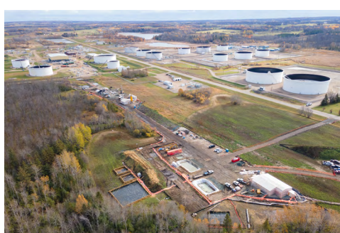
> Repair work site outside terminal.