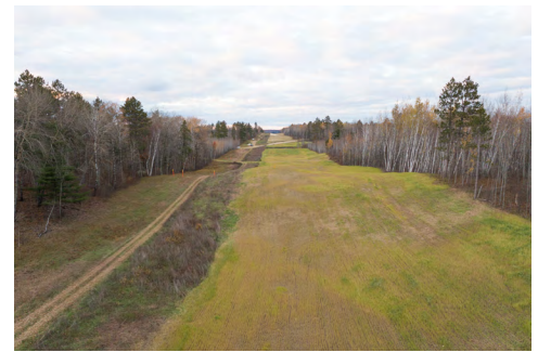
> Green grass grows over the right of way with the replaced pipeline operating about four feet below ground. Photo from November near Bagley, MN