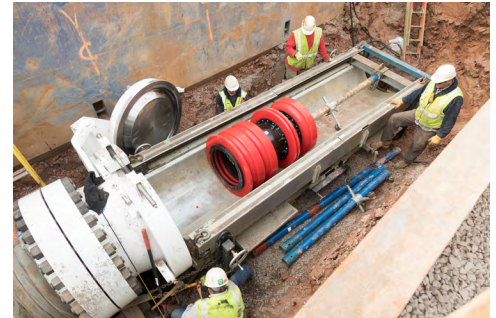
> A series of these cleaning tools will be put into the now retired pipeline and then removed as they scrub and wipe clean the distance of the old line.