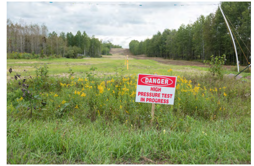
> During the 24-hour water pressure testing period, signs were posted and property owners made aware. Photo taken in October near Wrenshall, MN.