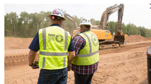
> Skilled union workers largely from Minnesota and Midwest states were able to work close to home on the project that now operates where they live and recreate.