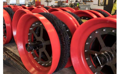
> The old Line 3 is now deactivated. It was purged of oil and will be cleaned with a combination of tools with scrubbers like these and cleaning solution.