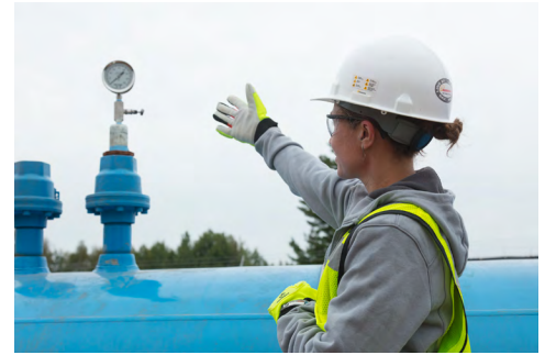
> One of the final steps prior to putting the replacement pipeline into service involves filling segments with water and pressure testing to above normal operating pressure to show structural integrity. Photo near Carlton, MN.