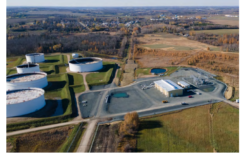
> All eight new pump stations are operating safely to keep North American energy products moving through the new pipeline at about walking pace 24 hours a day. Photo from November in Clearbrook, MN.